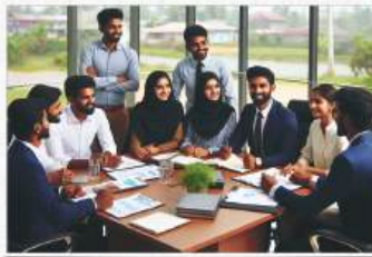
INVENTORY & MATERIAL MANAGEMENT