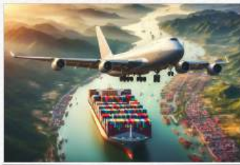
SUPPLY CHAIN & LOGISTICS MANAGEMENT