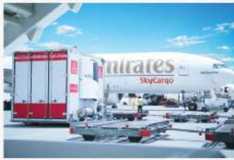
TRANSPORTATION & CARGO MANAGEMENT