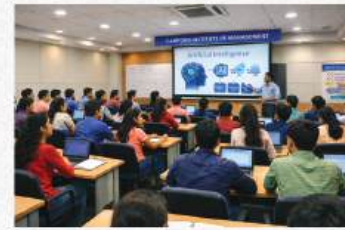
BUSINESS AUTOMATION SAP & ARTIFICIAL INTELLIGENCE