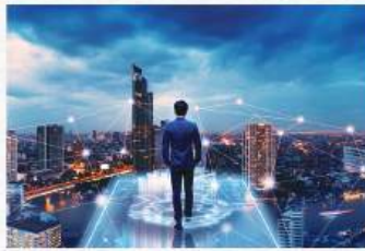
IMPORT & EXPORT GLOBAL BUSINESS MANAGEMENT